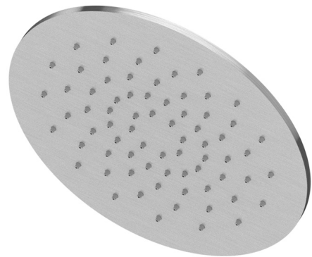
Portata Flow rate